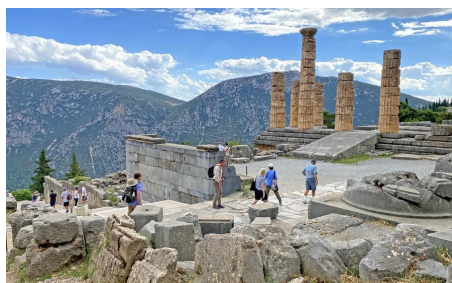
Temple of Apollo, Delphi, Greece