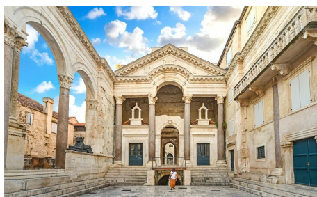
Diocletians Palace, Split, Croatia

Embark on an enriching seven-night cruise aboard the deluxe World Traveller, uncovering the rich history and stunning landscapes of Croatia, Montenegro and Greece. Beginning in Venice and ending in Athens, this journey takes you through ancient walled cities, medieval villages and iconic archaeological sites steeped in centuries of culture. Explore UNESCO World Heritage treasures such as Dubrovnik's seventh-century city walls, Kotor's charming old town nestled beneath emerald slopes, and Split's remarkable fourth-century Palace of Diocletian. Visit the elegant Achilleion Palace on Corfu, a neoclassical marvel built for Empress Elisabeth of Austria, and step back in time at Delphi's Temple of Apollo, once considered the center of the ancient world. Throughout your voyage, engage with expert lecturers who bring the fascinating stories of Roman, Greek, Byzantine, Slavic and Venetian civilizations to life, enriching your understanding of the region's diverse heritage. Savor masterfully crafted wines and fresh, local cuisine as you glide through breathtaking harbors and picturesque towns, including historic Hvar and the stunning Bay of Kotor. Deepen your experience with our optional Athens Post-Tour Extension.