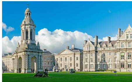
Trinity College, Dublin, Ireland