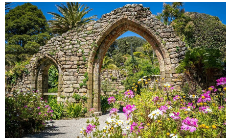
Abbey Ruins Flowers, Tresco, Isles of Scilly