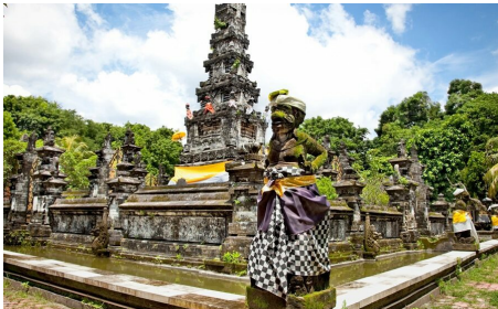
Jagatnatha Temple, Bali

On this incomparable adventure, discover the eclectic vibrance of Singapore, the extraordinary biodiversity of Borneo and the compelling cultural mosaic of Indonesia's spectacular archipelago. Begin by spending two nights in Singapore before boarding the deluxe small ship, Le Jacques Cartier, for a 9-night cruise. Wrap up with a two-night stay in Bali. In lush rainforests, witness an amazing array of wildlife, including endangered species. Enjoy a guided walking safari of UNESCO-designated Komodo National Park, home to the largest lizard on Earth, the Komodo dragon. Explore Borneo's unforgettable Tanjung Puting National Park from a river surrounded by tropical rainforest; look out for orangutans and proboscis monkeys in their natural habitat. Tour the bustling cities of Singapore and Denpasar, and small villages where you'll experience local culture, learn about batik, see acclaimed Balinese dancers and root for your favorites in a buffalo race!