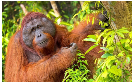
Orangutan in Tanjung Puting National Park, Borneo